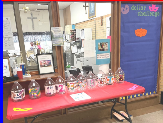
To kick off our annual Dinner Auction preparations, the students are participating in a friendly DOLLAR CHALLENGE competition. Class totals will be calculated weekly and updated on our Leaderboard.